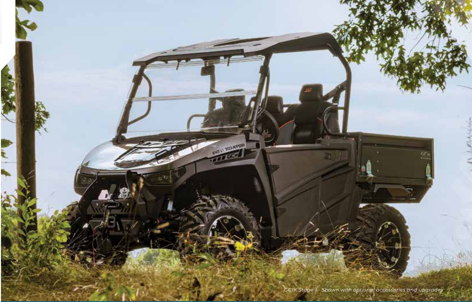
GC1K Stage 1 - Shown with optional accessories and upgrades