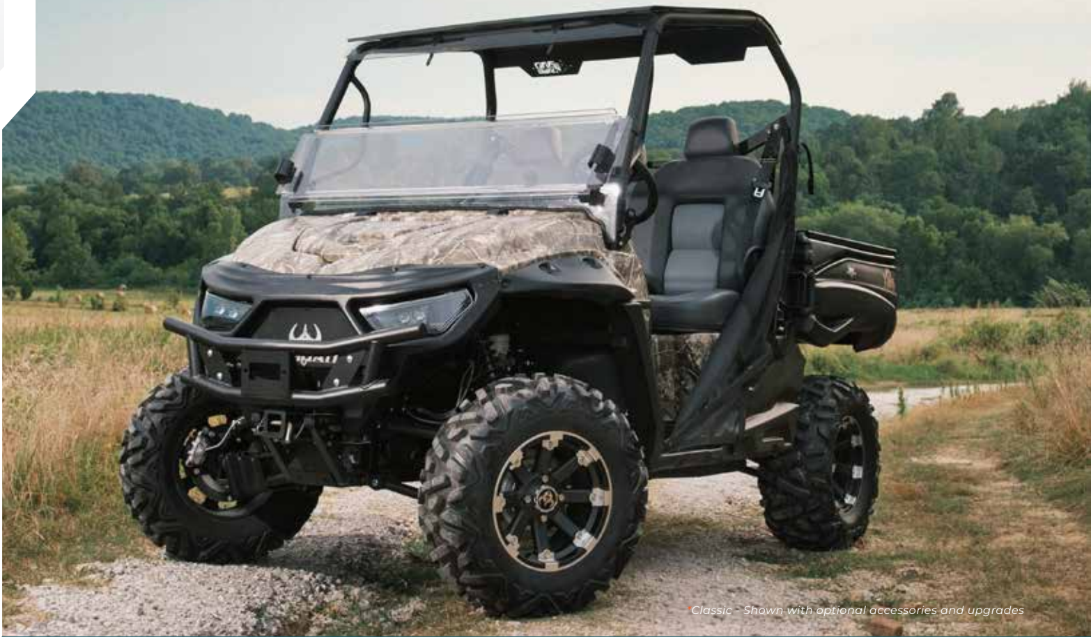
Classic - Shown with optional accessories and upgrades