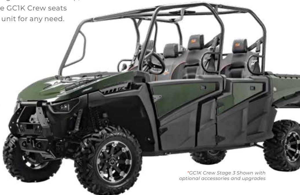
*GC1K Crew Stage 3 Shown with optional accessories and upgrades