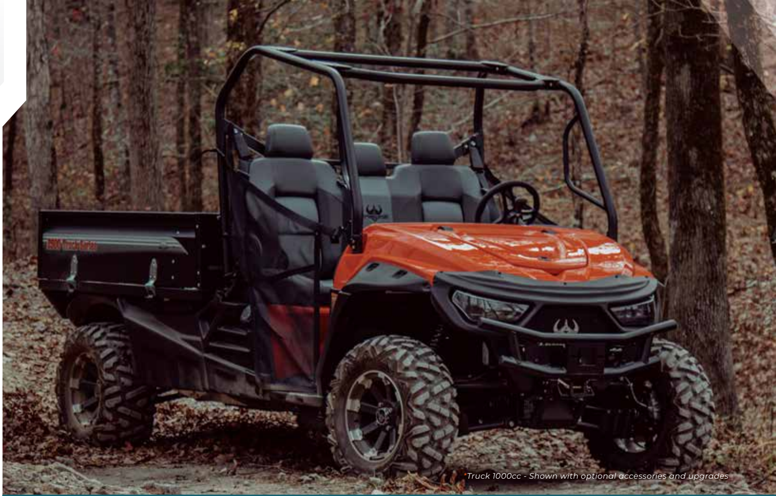
*Truck 1000cc - Shown with optional accessories and upgrades