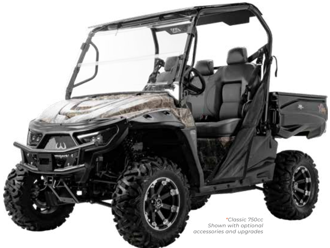
*Classic 750cc Shown with optional accessories and upgrades

*See retailer for complete warranty details.