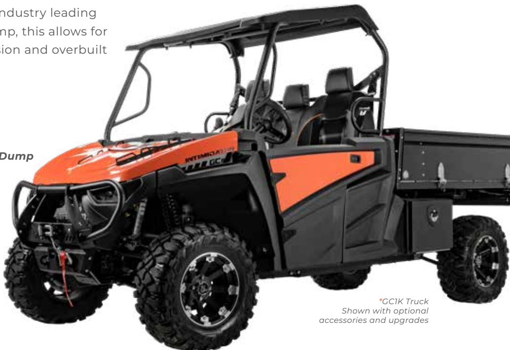
*GC1K Truck Shown with optional accessories and upgrades