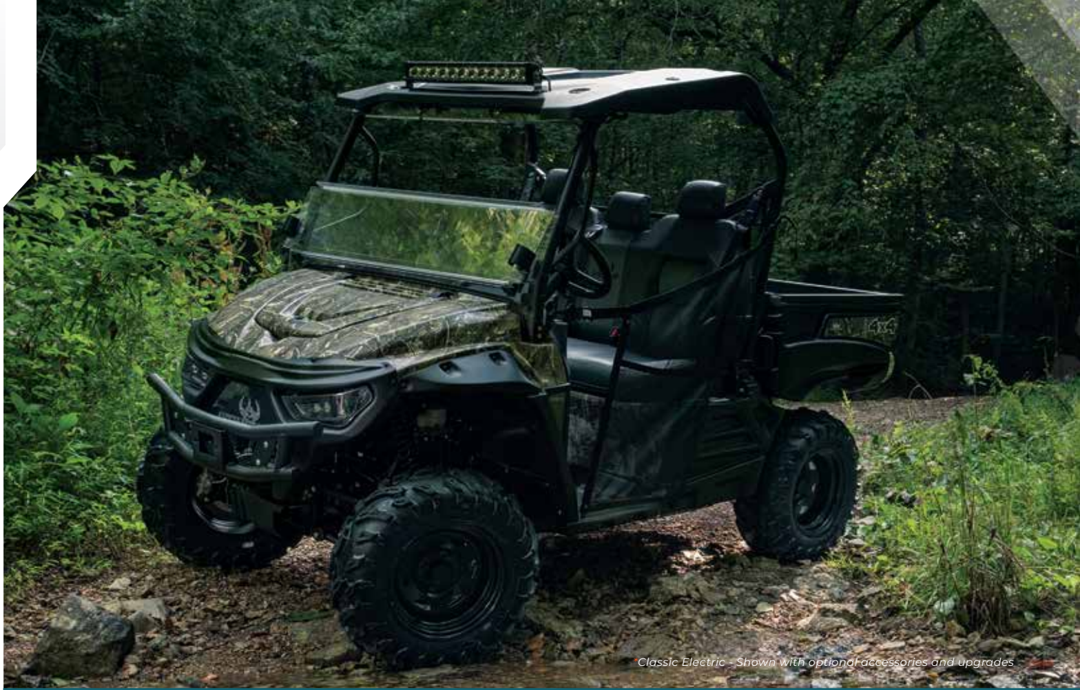
*Classic Electric - Shown with optional accessories and upgrades