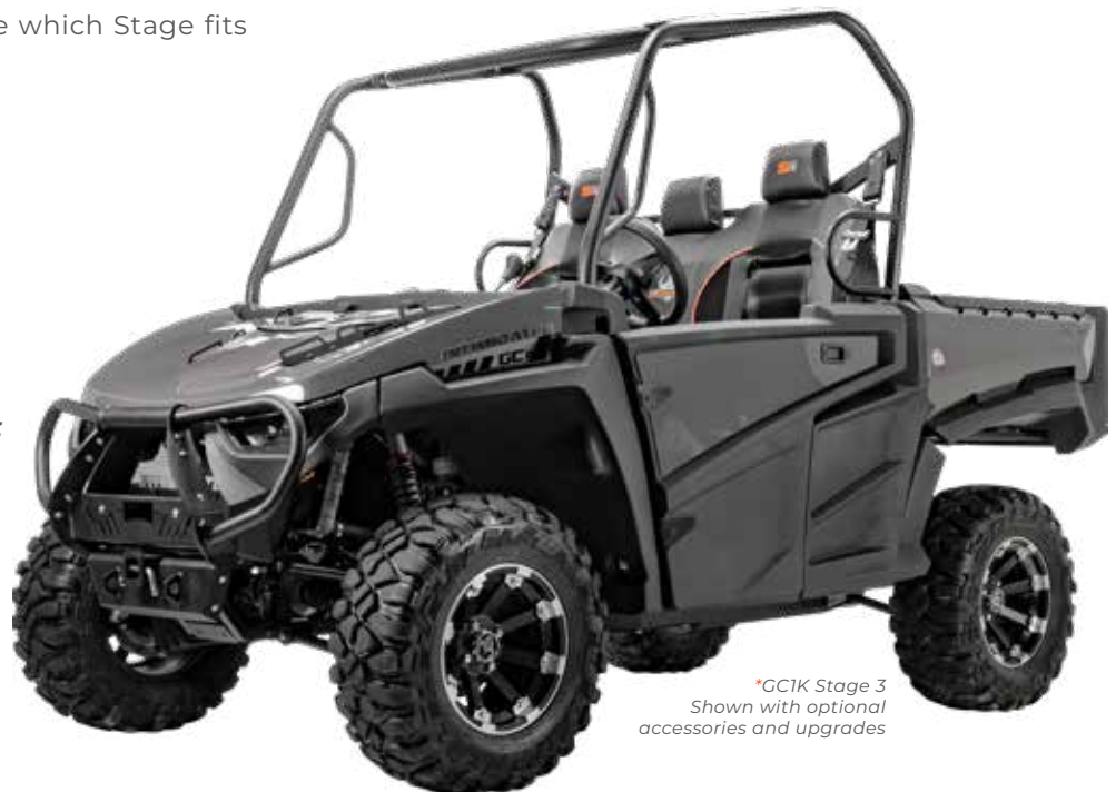
*GC1K Stage 3 Shown with optional accessories and upgrades