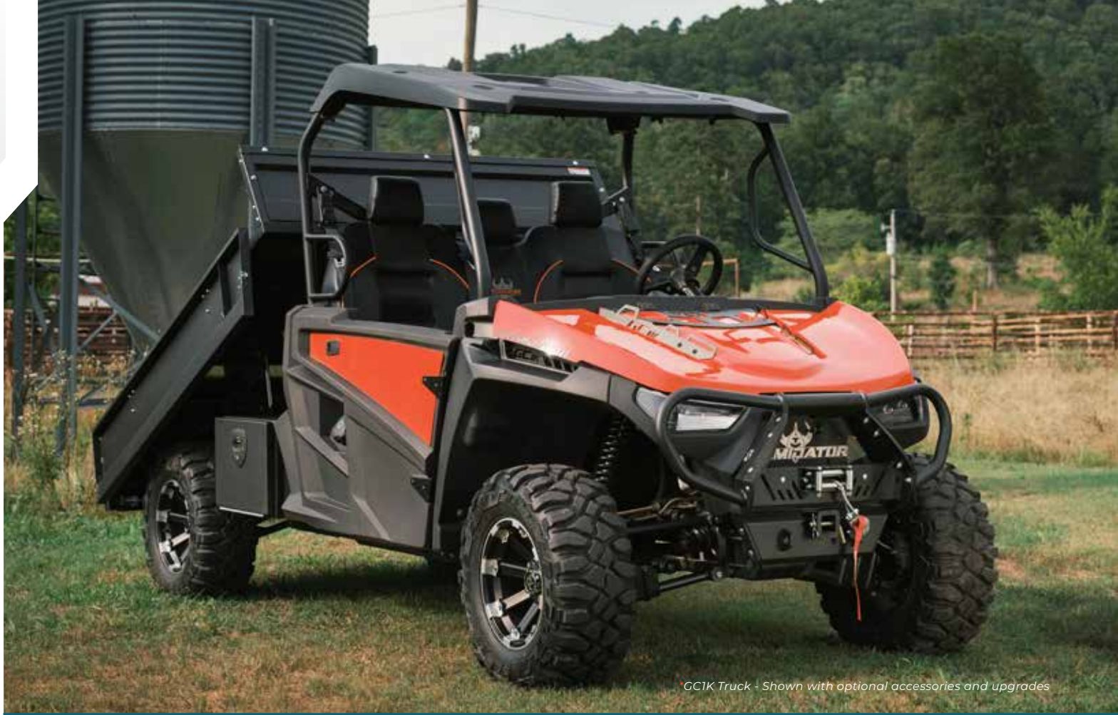
*GC1K Truck - Shown with optional accessories and upgrades