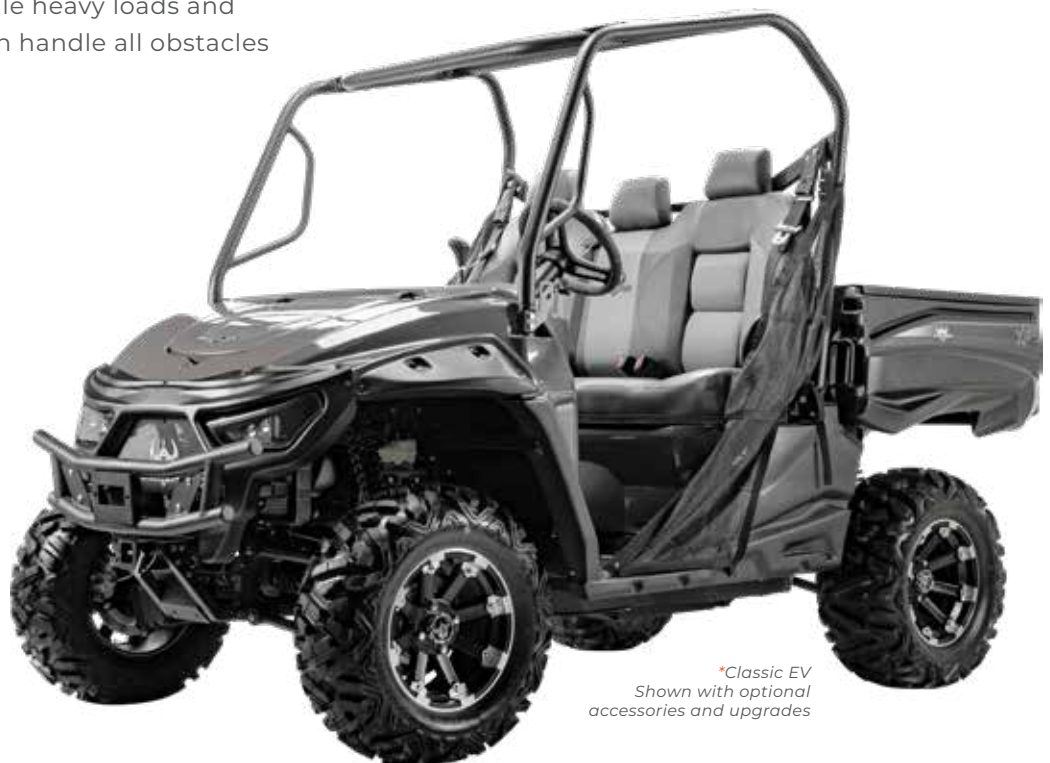
*Classic EV Shown with optional accessories and upgrades

*See retailer for complete warranty details.