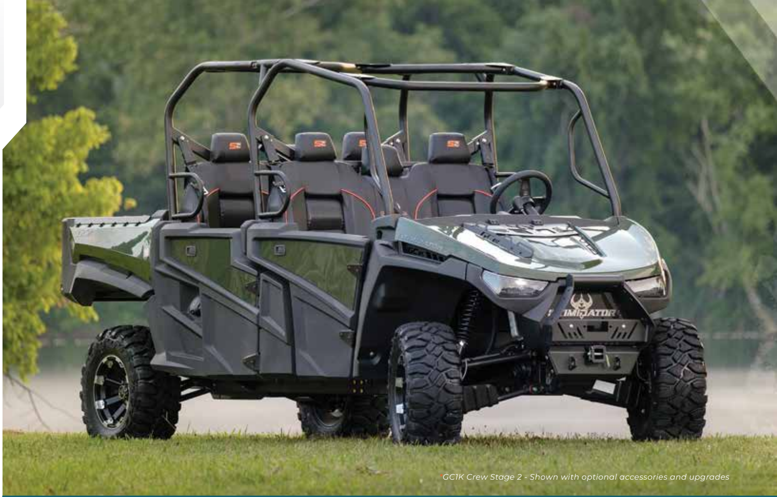
*GC1K Crew Stage 2 - Shown with optional accessories and upgrades